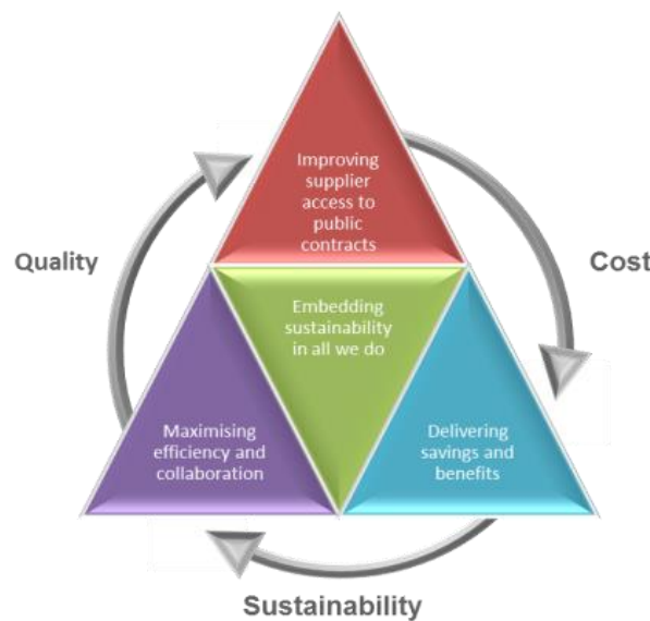
Figure 3: Scottish Model of Procurement

We will have a commodity strategy for each procurement project valued at £50,000 or over. Each strategy is supported by the sustainability test and the Sustainable Public Procurement Prioritisation Tool (SPPPT). The tool identifies ways we can include social, economic and environmental considerations in contracts.